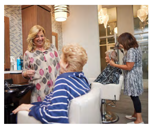
We remain flexible so your day can evolve just the way you choose.